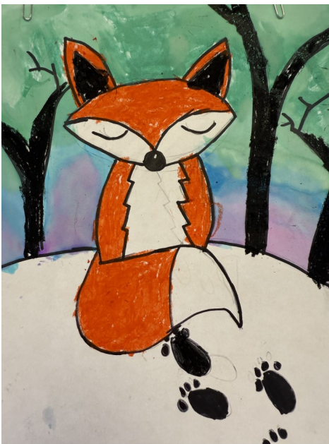
Grade 3 Winter Fox and Northern Lights