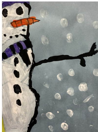
Grade 2 Up Close Adorable Snowman