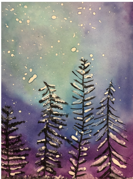
6L Winter Trees