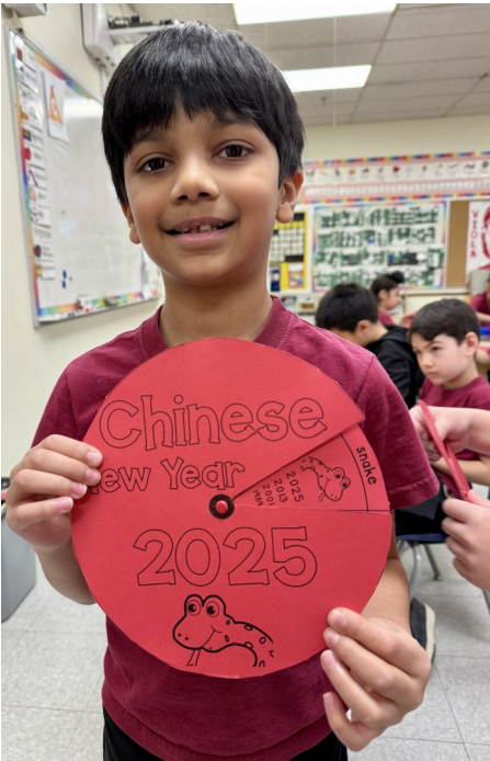
Grade 2 Chinese Zodiac Wheels