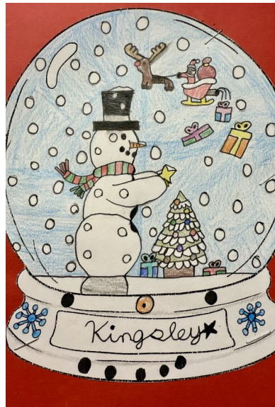
4Q Globes of Winter Fun