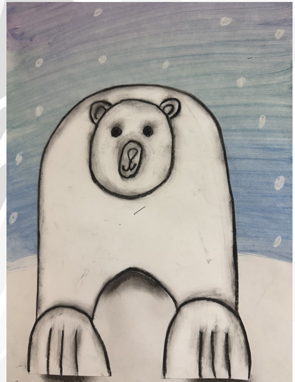
4C Northern Lights