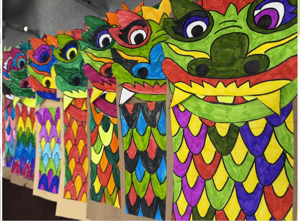
Grade 3 Dragon Puppets