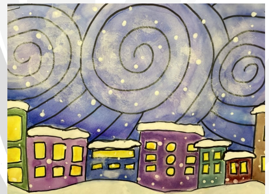
5L Snowy Scene