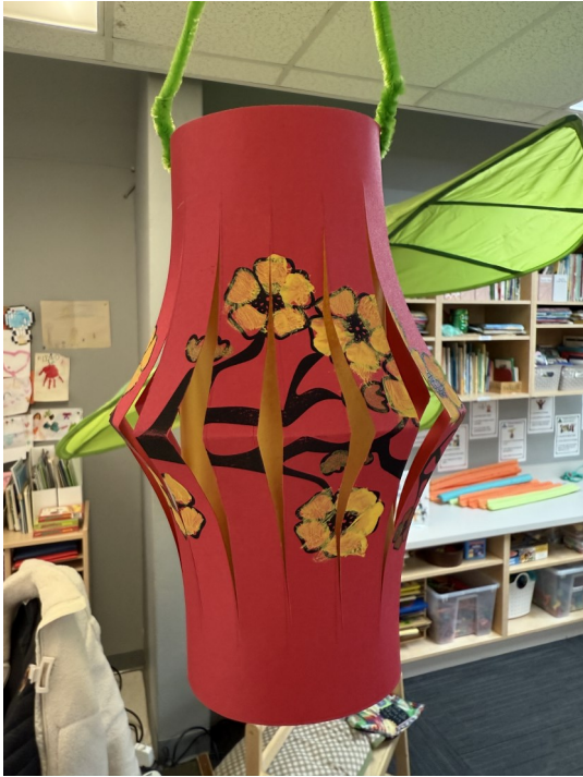
KV Cherry Blossom Lanterns