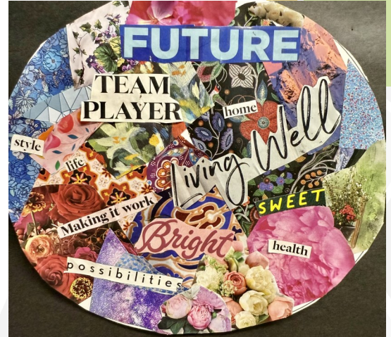
6L New Year Vision Boards